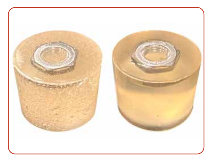
Acrylic samples mounted without & with pressure chamber