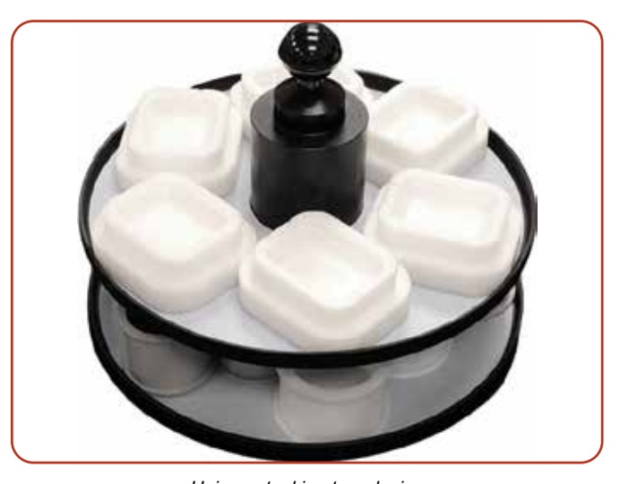
Unique stacking tray design