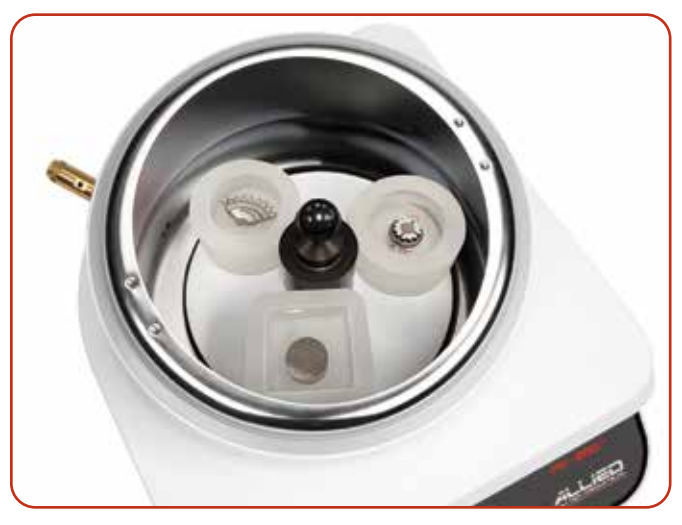
Chamber that easily holds oversized samples