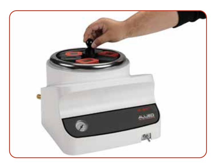
Can fit three (3) stackable trays inside the chamber