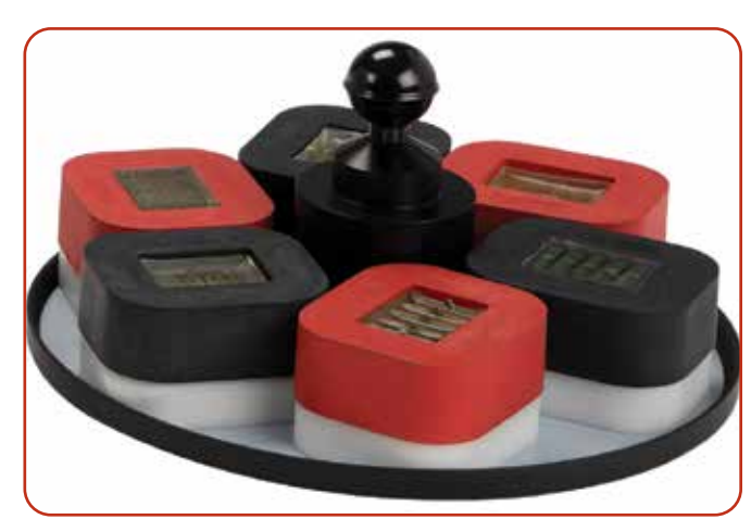
Stacking tray with PTFE lining for easier cleanup