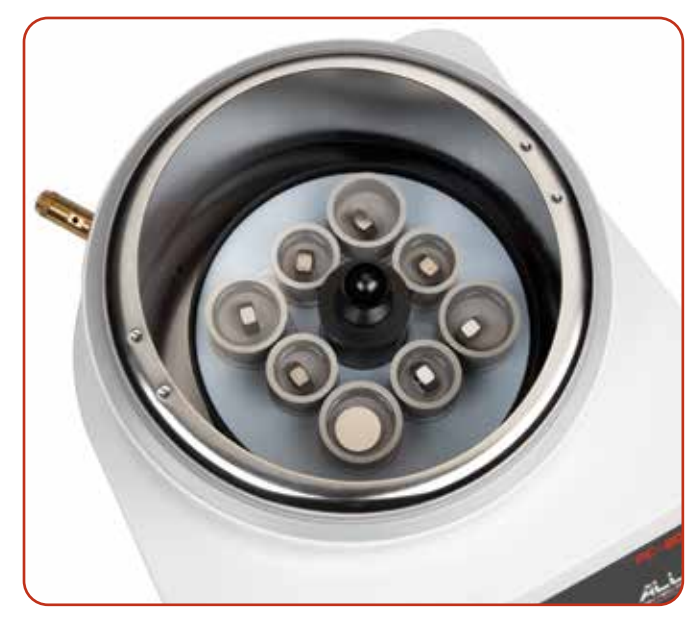
Large chamber accommodates multiple samples